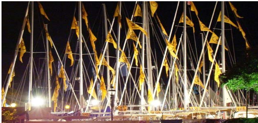
Annapolis Boat Show – 2010

May 15 th - Sunday: Going into Commission Dinner. Stuyvesant Yacht Club: cocktails, 6 p.m. dinner, 7 p.m. More information to follow.