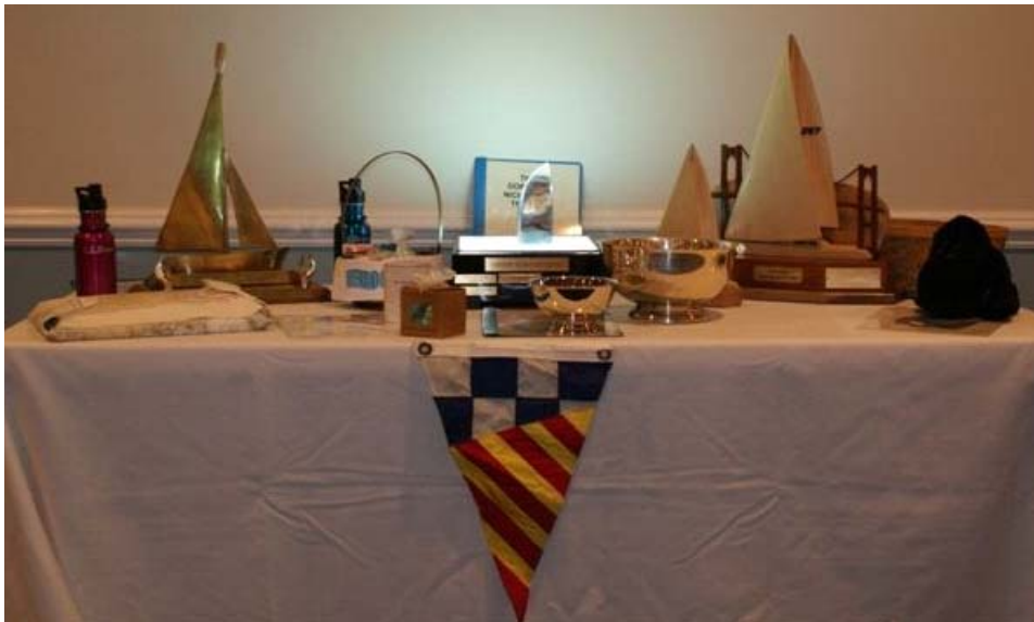
The Awards Table.